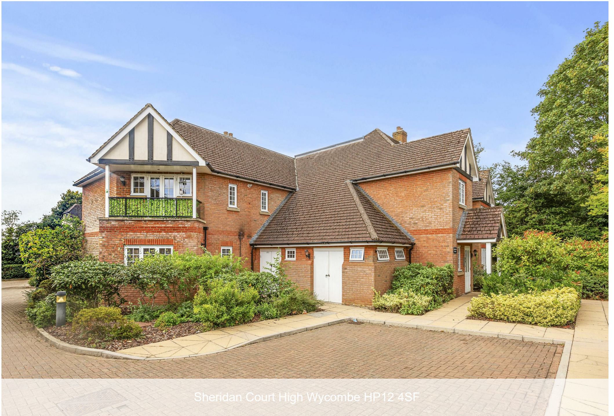
Sheridan Court High Wycombe HP12 4SF